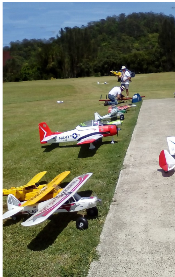
The December meeting line up showing about a half of the planes that were brought along for the day.