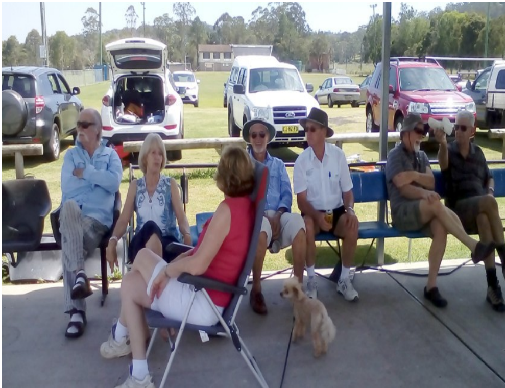
2016 Christmas crowd enjoying the clear day and pleasant company.