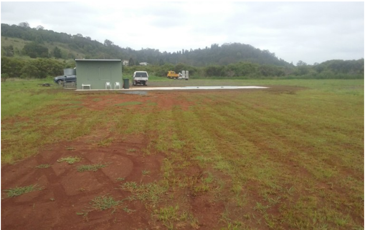
Looking back from the runway, now much greener.