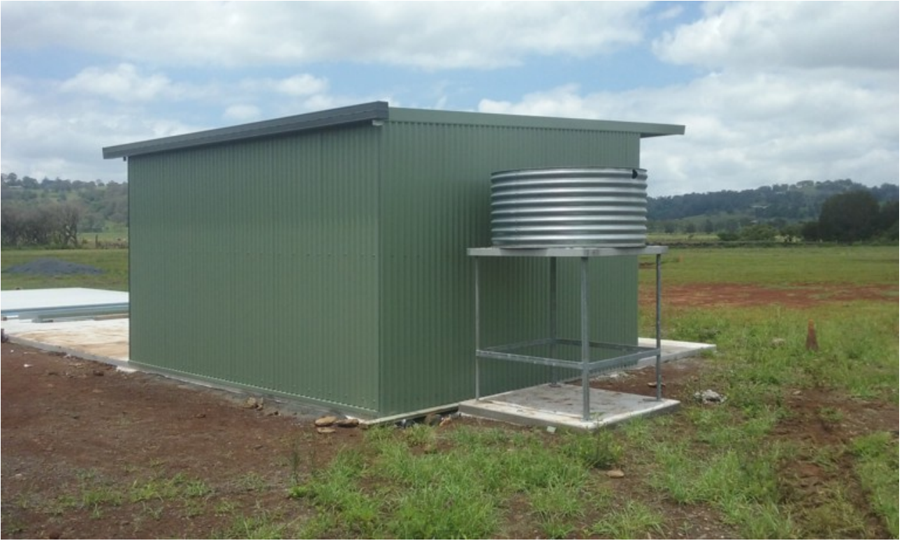
Well done to those men.