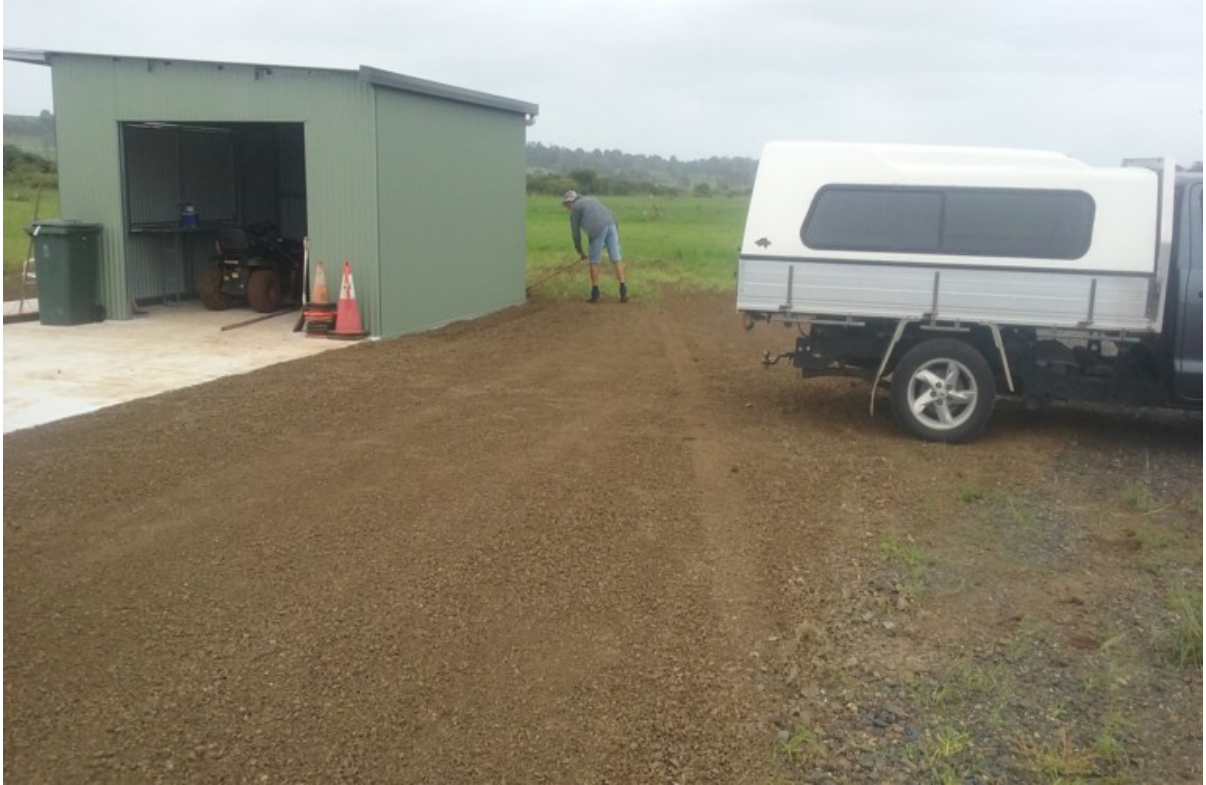
The concrete surrounds are well finished and very tidy.