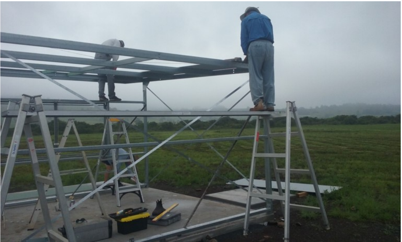
This picture shows the first sheet being installed.