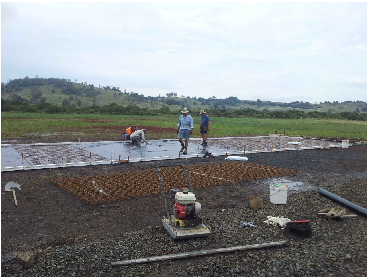
The field crew, hard at it preparing for the concrete.

The lock up area will have a canteen/servery section and room for the BBQ out of the weather. Lots of space and a new outlook is always welcome, and with the very welcome news of a grant, via Thomas George, a few more facilities will be added as time allows.